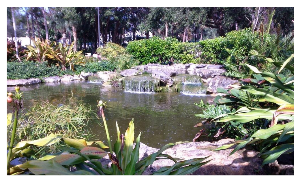
Palm Beach Gardens Campus