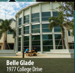
Belle Glade 1977 College Drive