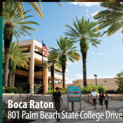
Boca Raton 801 Palm Beach State College Drive