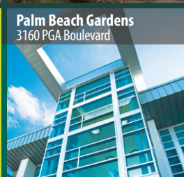
Palm Beach Gardens 3160 PGA Boulevard

PALM BEACH STATE COLLEGE 4200 Congress Avenue Lake Worth, FL 33461-4796