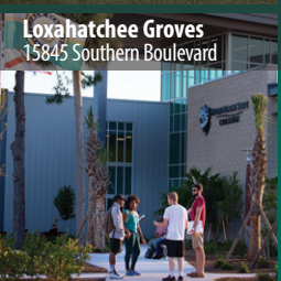
Loxahatchee Groves 15845 Southern Boulevard