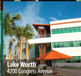
Lake Worth 4200 Congress Avenue