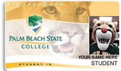
Front View Library Borrower ID

Your Borrower ID is the full 14-digit card number on the back of your PantherCard that starts with 24901. Your Pin/Password is a 4-digit number that represents your 2-digit birth month and 2-digit year of birth. So if, for example, you were born in July of 1995, your pin would be 0795.