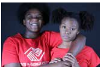
March 19-April 19 Photography by Boys & Girls Clubs of Belle Glade