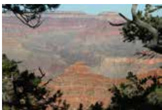
January 8-19 Photography & Mixed Media by Bill Sykes & Friends