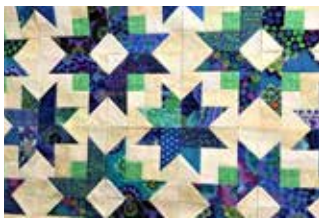
March 11-18 Lakeport Quilters