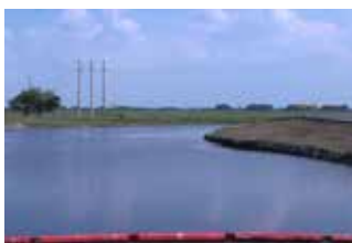
January 29-February 12 Interactive Photography by Jean Orelie