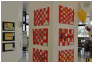
February 15-28 Artwork by Arts4All Florida - Palm Beach County WestFest