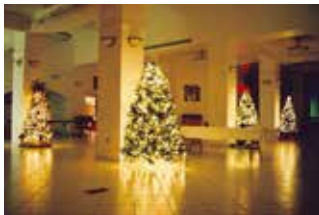
November 13- December 13 Festival of Trees