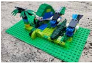
October 9-27 Clewiston Library Brick Builders Club

Visual art by the following local artists will be featured in the DHCAC Grand Hall during 2023-2024 Season performances.